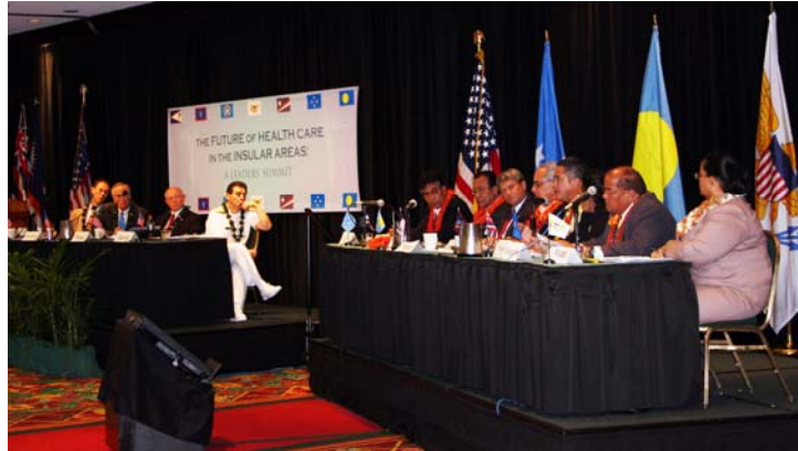
Principals at Health Summit.

Each of the U.S. cabinet members and Insular Area leaders present made official remarks for the record. In addition, the Honorable Donna M. Christensen, M.D., U.S. Virgin Islands Delegate to Congress and Chairwoman of the House Natural Resources Subcommittee on Insular Affairs, and the Honorable James “Duke” Aiona, Lieutenant Governor of Hawaii, were invited to make remarks. Full transcripts of the remarks follow.