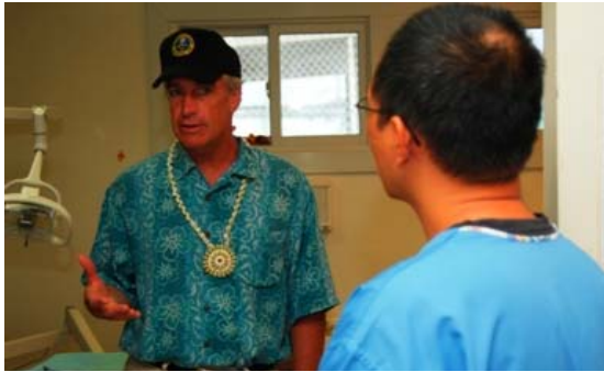
Sec. Kemnthorne sneaking with a health worker

another occasion, visiting a hospital in Ebeye, I was told the hospital personnel were having problems because of the lack of an emergency generator. At this hospital, Interior staff worked with the Marshall Islands Government to obtain funding to purchase a new emergency generator. These situations underscore the importance of our continuing to focus on both water and energy, both of which are absolutely necessary in the provision of quality health care.