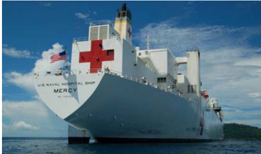
USNS MERCY (T-AH 19) anchored off the coast of Chuuk, Federated States of Micronesia

Areas, exclusive of Puerto Rico again. And they have about five thousand dependents. And again, they are entitled by statute to health care supported by the Department of Defense. In short, their health care is also our concern.