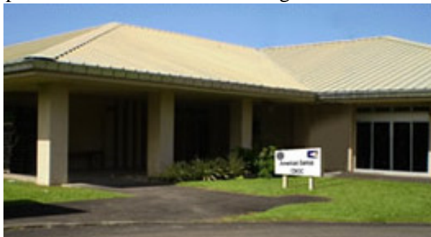
AS VA Community Based Outpatient Clinic.

But it also offers tremendous potential opportunities to align authorities for sharing services. For example, for veterans, what we're trying to do and have done successfully with our great partners and DOD and the Navy, here at Tripler. We have CBOC, a Community Based Outpatient Clinic that we are improving in Guam, understanding the lessons of our past, making sure it's co-located as part of the strategic planning of the Navy as we anticipate this larger population growth from the military restructuring. We need to share in the strategic planning to be able to make sure that we are at the table with them just as we need to be at the table for strategic planning with all of the aspects of people that use health care. Shared staff, shared technology are great opportunities. Leveraging the technology of and the power of telemedicine, and we have people in the audience who are expert in that and I'm pleased to see you being here to participate. Having call centers that are actually really focused on service delivery in understanding what we need to do to make sure that the power of information comes together to those kinds of call centers. And again, attacking that time distance conundrum. LBJ Hospital in American Samoa is a great example of where we are working at an agreement to be able to access those facilities and provide better on-island access for our veterans, lining up the authorities and the capabilities.