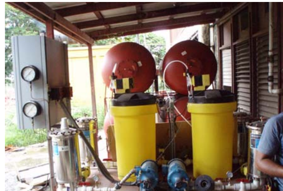
Water filtration system in Chuuk.

I'm pleased to report the Interior's Office of Insular Affairs team working with the Chuuk hospital staff, using tanks and pumps procured locally and installed by local maintenance staff, has improved the water supply to a number of departments at the hospital, including the emergency room and the operating room. Also, a rain catchment system was constructed and installation of new pumping equipment liners and covers to storage tank