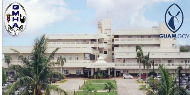
Guam Memorial Hospital (GMH).