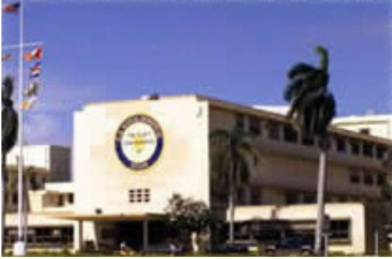
Guam VA Community Based Outpatient Clinic.

09.30.08 Closing Remarks: Let me just have all the VA people stand up. I guess the