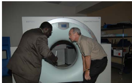
Sec. Kempthorne visiting Roy Lester Schneider Hospital.

The quantity and the quality of hospitals and health centers in Insular Areas (territories and freely associated states) still vary and some are not yet up to an acceptable level. Additionally, I am discussing this idea with the American, the Catholic, and the District of Columbia Hospital Associations. I have already met with all and I'm hoping we can encourage stateside health care professionals to volunteer their time and skills in this area. As they saw in both St. Croix and St. Thomas, there are departments with state-of-the-art medical equipment, but unfortunately it is not universal. Some jurisdictions struggle daily to provide care in substandard facilities. Others are somewhere in between. In addition, Guam will need to expand its health care capacity fairly quickly to deal with a large buildup of military force that is expected as we transfer some 8000 Marines from Okinawa to Guam. For other jurisdictions, increased immigration is creating entirely different issues.