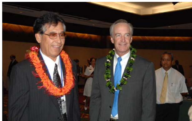
President Mori (FSM) and Kempthorne.

We do welcome the findings of the recently released report by the Interior's Office of Inspector General. The report points out that the inadequacy of health care facilities is but one side of the many-sided problems of health care delivery in our islands. The short supply of health care professionals is another critical problem that is exasperated by the real difficulty of attracting and retaining health care professionals or specialists to the FSM. One immediate result of inadequate facilities and health care specialists is that we have been spending large sums for medical referrals, in excess of $10 million annually. This does not include the cost of treating our other citizens who have been leaving the FSM in search for better medical