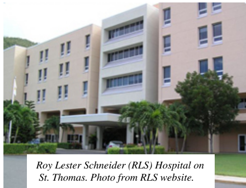
Roy Lester Schneider (RLS) Hospital on St. Thomas.

With the stage being set, let me provide you a snapshot view of the US Virgin Islands health care infrastructure, our challenges, our areas of improvement and our next steps. Our four islands are approximately 110,000 persons and an increasing number of undocumented illegal immigrants. A population being served by the