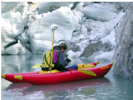
A scientist kayaks among the jumbled icebergs at the terminus of Grinnell Glacier at Glacier National Park as she uses a GPS unit to record the glacier's extent.

Cooperative Landscape Conservation: The National Park Service's approach to climate change, science, adaptation, and communication is through the Cooperative Landscape Conservation (CLC) program. The NPS leverages its resources and expertise with that of other Federal agencies, States, Tribes and others to focus on problems of concern to the nation's varied ecosystems. National parks contain some of the Nation's most treasured landscapes and historical sites, many of which are particularly vulnerable to changes in the environment. The NPS develops and applies science and research to