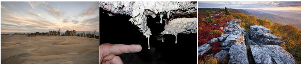
Designated in January 2021, the three newest national natural landmarks; pictured left to right: Lanphere and Ma-le'l Dunes, CA; Sulphur Cave and Spring, CO; and Bear Rocks and Allegheny Front Preserve, WV.

To-date, 602 natural areas, encompassing approximately nine million acres in both rural and urban settings, have received the distinction as a national natural landmark. The NPS works alongside landowners, managers, and other partners to encourage and support the conservation of these nationally significant sites.