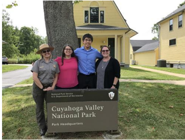
A National Park Business Plan Intern at Cuyahoga Valley NP.