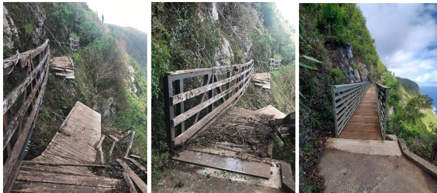
Projects like this one at Kalaupapa National Historical Park, to repair and rehabilitate a flood damaged bridge on the Upper Pali Trail are funded through the Repair and Rehabilitation program. The Pali Trail is the only overland access into the Kalaupapa settlement, and it is used by NPS and State staff that hike to work, by visitors to access the settlement, and by the mule tour operators.

Typical large-scale projects may include campground and trail renewal, wastewater and water line replacement, or housing renewal. These projects also incorporate the Department of the Interior (DOI) commitment to sustainable construction practices, Architectural Barriers Act Accessibility Standards (ABAAS) and, the DOI’s Energy Management Program.