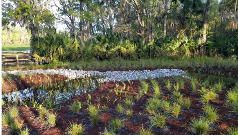
Water quality protection is a fundamental principle of the Wild and Scenic Rivers Act; Wilson's Landing Point, an area along the Wekiva River, was restored to prevent stormwater runoff into the river.