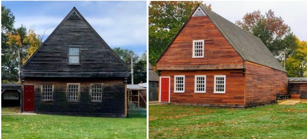
Projects like this one at Saugus Iron Works National Historic Site, to perform exterior cyclic maintenance repairs to the Saugus Iron Works Museum, are funded through the Cyclic Maintenance program. Originally constructed in 1917, the museum itself is a historic structure, and houses exhibits and artifacts excavated during the archaeological dig performed on-site in the 1940s and 50s.

Cyclic maintenance for cultural resources can include projects, such as re-pointing masonry walls of historic and prehistoric structures, pruning historic plant material, stabilizing eroding archeological sites, and preventive conservation of museum objects. Artifact preservation and restoration gives visitors a physical connection to history and enriches a location's interpretation experience.