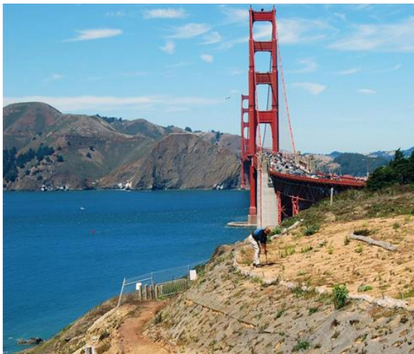
A seasonal biological technician uses a soil sampler at the Presidio native vegetation restoration site in Golden Gate National Recreation Area.

The Wildlife Health Team provides professional veterinary consultation and technical assistance to parks. Among the priority wildlife diseases receiving ongoing surveillance and management are Chronic Wasting Disease, Plague, Rabies, vector-borne disease and tick-borne disease, bighorn sheep pneumonia