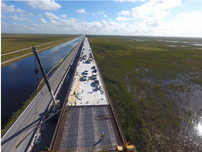
The Tamiami Trail Next Steps Project is enhancing the connectivity and water flow between the marshes north and south of the Tamiami Trail while maintaining the vital transportation link between southwest Florida and Miami.

evaluation components of this program provide technical tools and data that assist the NPS in understanding the function of the present ecosystem, in evaluation of alternative plans for restoration, and in assessment of the effects of built restoration projects on NPS resources. The program also supports work on detection, containment and control techniques for exotic species, conducts studies of large-scale ecosystem events, and studies the potential effects of changing weather patterns on sea-level rise and saltwater intrusion; all of which threaten DOI resources in south Florida. The program will focus applied science projects on data and syntheses needed to inform decisions regarding the design and function of the current and future restoration projects, the effects of infrastructure and operations on threatened and endangered species, the effects of large scale disturbance events (such as the effects of the 2015 seagrass die-off in Florida Bay, and the long-term impacts of Hurricane Irma in 2017), and the effects of environmental impacts and invasive species on NPS resources.