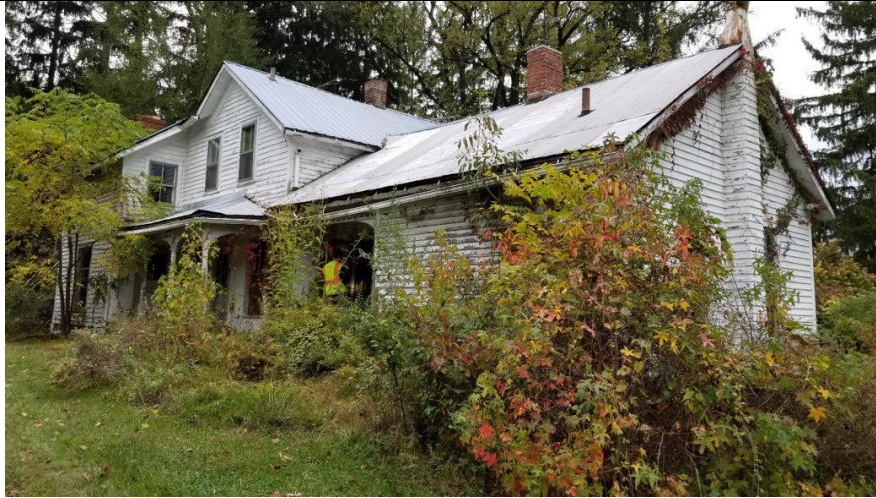
Image: View of an overgrown, vacant structure in Cuyahoga Valley National Park. In FY 2021, the LRF funded demolition of multiple excess buildings. Demolishing excess structures, and removing them from the bureau's asset inventory, is often the most reasonable and effective method to eliminate past and future maintenance liabilities and requirements.