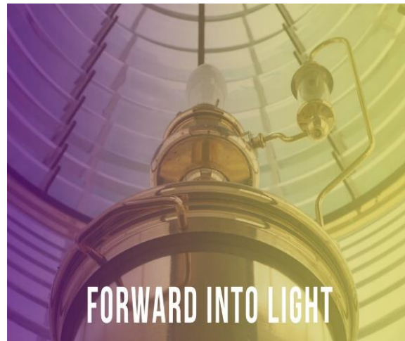
Social media image from Sleeping Bear Dunes National Lakeshore using the Forward Into Light photo overlay from the Women's Suffrage Centennial Commission.

Connecting Americans with their history encourages a broad and diverse constituency for cultural heritage stewardship. From June 2019 through August 2020, the National Park Service and its partners commemorated the centennial of the 19th Amendment to the Constitution, which acknowledged women's right to vote. One of the signature events was "Forward into Light," a nationwide campaign by the congressionally appointed Women's Suffrage Centennial Commission. "Forward into Light" was a popular rallying cry for the women's suffrage movement. Suffragists carried banners at marches and demonstrations emblazoned with a compelling verse: "Forward out of error / Leave behind the night. / Forward through the darkness, / Forward into light!" On August 26, 2020, buildings and landmarks across the country and on social media were lit up in purple and gold, the colors of the American women's suffrage movement. Over 90 NPS parks, programs, and partners participated, linking visitors across the US and around the world to this interpretive moment.