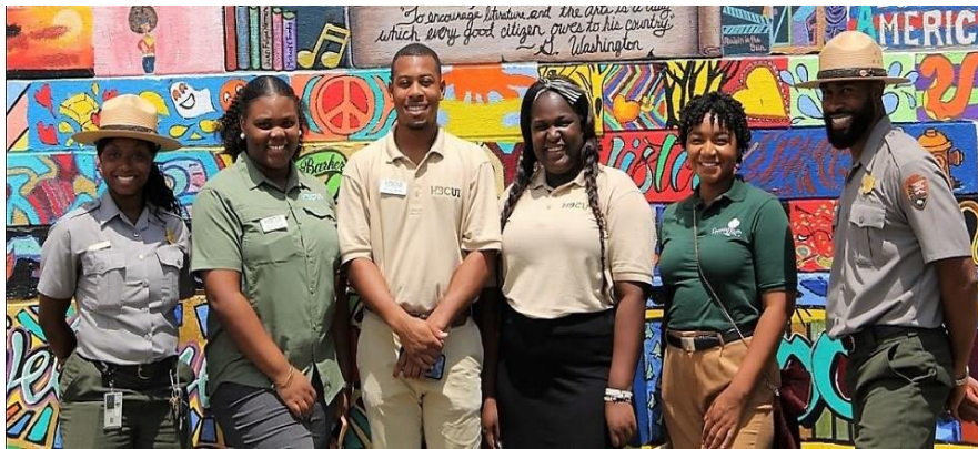
HBCUI Interns with NPS rangers