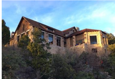
The Grand Canyon Lodge on the North Rim

Located in Arizona, Grand Canyon National Park encompasses 277 miles of the Colorado River and adjacent uplands. The park is home to much of the immense Grand Canyon, which is one mile deep and up to 18 miles wide. Layered bands of colorful rock reveal millions of years of geologic history. The Grand Canyon is unmatched in the vistas it offers visitors from the rim.