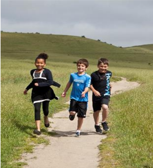
Youth enjoying the Juan Bautista de Anza National Historic Trail.

National Trails System: The National Trails System (NTS) is a nationwide network of national scenic trails, national historic trails, and national recreation trails. Of the 30 federally-administered national scenic and historic trails, NPS administers or co-administers 23 trails. The network of national scenic and historic trails within the system, at over 55,000 miles, is larger than the interstate highway system and