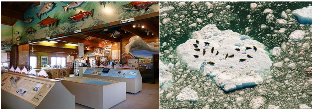
Left: Interior of King Salmon Visitor Center servicing Katmai National Park and Preserve Right: Seals on Ice, Wrangell-Saint Elias National Park and Preserve

In FY 2022, the NPS seeks to expand services at two visitor centers in Alaska. At Wrangell-Saint Elias National Park and Preserve, funding will support interpretive staff and joint operational costs to provide for a multi-agency public private partnership with the Tok/Ahtna visitor center. The shared facility supports visitor education and cultural resources and will expand visitor services to eastern Interior Alaska's public lands, specifically to Wrangell-St. Elias National Park and Preserve (WRST), the NPS' largest unit and the USA's largest wilderness. At Katmai National Park and Preserve, funding will support staff and a shared operational model to provide for a multi-agency, public private partnership with King Salmon visitor center. The shared facility supports visitor education and access to the entire Katmai region, and it aims to promote the appropriate use and enjoyment of Alaska's public lands by encouraging visitors and residents to seek meaningful, safe and enjoyable experiences on public lands and inspiring them to conserve and sustain the natural, cultural and historic resources of Alaska.