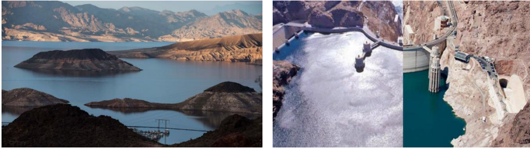
Left: View of Lake Mead National Recreation Area, with visible “bathtub ring.” Lake levels were much higher at the turn of the century; the lighter patches on the landscape were once under water. Current surface elevation levels are roughly 115 feet lower than in the year 2000. Right: Composite image highlighting the difference in water levels around the year 2000 compared to 2020.