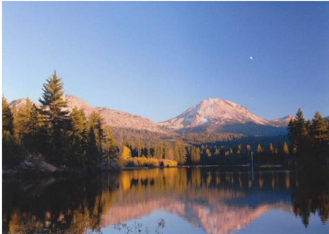
Lassen Peak and Chaos Crags Reflecting on Manzanita Lake

develop technical information so that management decision-making is based on science. Aquatic resource professionals address park management needs, including water resources planning, identification and prioritization of protection and restoration projects, development of water-related scientific information, aquatic resource restoration projects, and participation in legal or administrative processes.