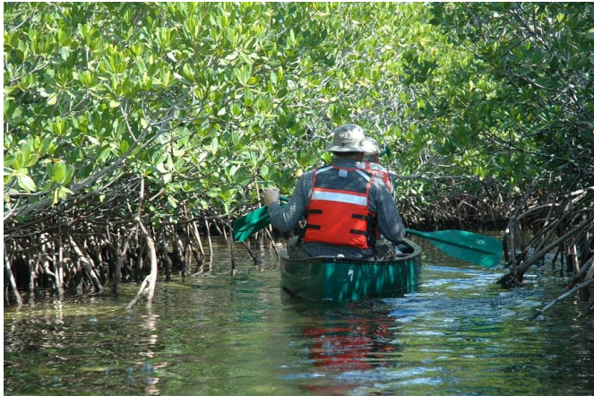
Mangrove forests like the one pictured here in Biscayne National Park are beautiful but also provide ecosystem services vital to the health of south Florida's wildlife and economy. CESI-funded research monitors the health of south Florida mangrove forests to assess and refine ongoing CERP activities.

The Critical Ecosystems Studies Initiative will remain one of the primary sources providing scientific information for use in restoration decision-making and guiding NPS land management responsibilities in south Florida. CESI-funded applied science has contributed to the basic body of knowledge about the