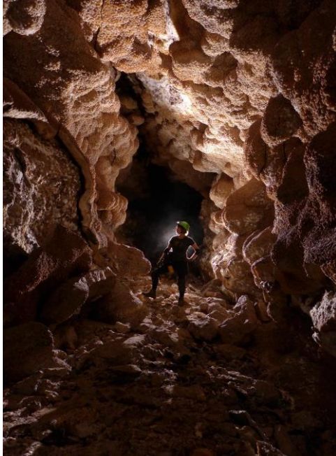
A Geoscientists-in-the-Parks intern standing near the entrance to Jewell Cave National Monument. Over a 25-year period the program placed 1,968 interns, provided 1.1 million hours of service and assisted 213 NPS parks/offices.

Resource Damage Assessment and Restoration: The NPS provides technical support and guidance to parks in assessing injuries to park resources and seeking damages for restoration pursuant to the System Unit Resource Protection Act (54 U.S.C. 100721), the Oil Pollution Act of 1990 (OPA) (104 Stat. 484), the Clean Water Act (CWA) (86 Stat. 816) as amended by OPA, and the Comprehensive Environmental Response, Compensation and Liability Act (CERCLA) (94 Stat. 2767). This support includes responses to oil and hazardous materials incidents affecting parks, together with incidents involving human-caused injury to park resources (natural and cultural), property, and visitor use. Costs and damages are recovered through negotiated settlements with responsible parties. Cost recovery provides a means to achieve restoration of injured park resources rather than requesting additional appropriated funds.