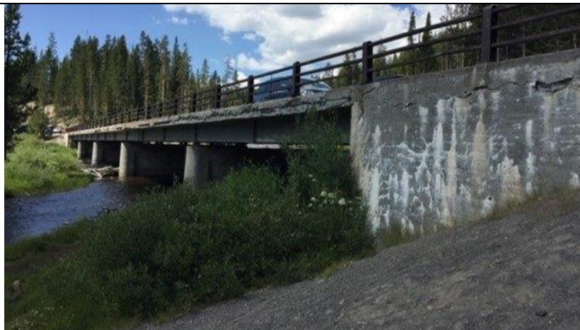
Image: Side view of the Lewis River Bridge in Yellowstone National Park. In FY 2021, the LRF funded work to replace the Lewis River Bridge. The existing structure has widespread deterioration of the deck and concrete; abutments and wingwalls exhibit widespread cracking, delamination, and spalling. Following construction, the bridge will be safer, and is expected to have a service life of 40-50 years.