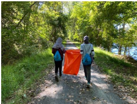
Students from the youth group of the Islamic Center from Hunterdon County, NJ participate in the Lower Delaware River Clean Up 2020, making a difference on this locally managed river.

National Wild and Scenic Rivers System: The National Wild and Scenic Rivers System was created by Congress in 1968 (P.L. 90-542; 16 U.S.C. 1271 et seq.) to protect certain rivers with outstanding natural, cultural, and recreational values in a free-flowing condition for the enjoyment of present and future generations. The Wild and Scenic Rivers Act is notable for safeguarding the special character of these rivers, while also recognizing the potential for their appropriate use and development. It encourages coordinated river management that crosses political boundaries and promotes public engagement in developing goals for river protection and implementing conservation actions. Rivers may be designated by Congress or, if certain requirements are met, by the Secretary of the Interior. Designated river segments need not include the entire river and may include tributaries.