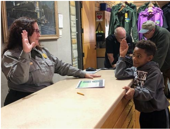
A junior ranger takes the oath

National Unigrid Brochure Program: Unigrid brochures developed, produced, and maintained by Harpers Ferry Center are distributed servicewide and used to orient visitors to parks and supply visitors with up-to-date, accurate, interpretive, and logistical information. The brochures serve as a tool to provide the official expression of the park and its resources, the responsible use of those resources, and the critical information necessary to keep visitors safe. In FY 2020, the National Unigrid Brochure Program worked with over 400 park sites. Over 15 million brochures were printed. COVID-19 issues systemwide adversely affected quantity, which usually runs between 22 – 24 million copies annually. Using recycled paper and soy-based inks, the program produces brochures that are environmentally friendly and cost effective: each brochure costs less than seven cents per printed copy. The program made significant gains in programmatic accessibility, converting another 14 park Unigrids to Braille, increasing the total number of Braille brochures to 320, about 83% of the total inventory of NPS park Unigrids. The program also continues to explore ways to enhance accessibility by using Unigrid materials in mobile applications, as well as online publication of content that is compliant with Section 508 of the Rehabilitation Act of 1973.