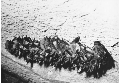
Townsend big-eared bats roost in the Dry Room of Oregon Caves

All the bats found at the Oregon Caves National Monument are insectivores that can consume as many as 500 insects an hour when feeding. Bats utilize Oregon Caves as a resting stop before returning outside to feed. They also use the caves to find mates, but their pups are usually born to the south.