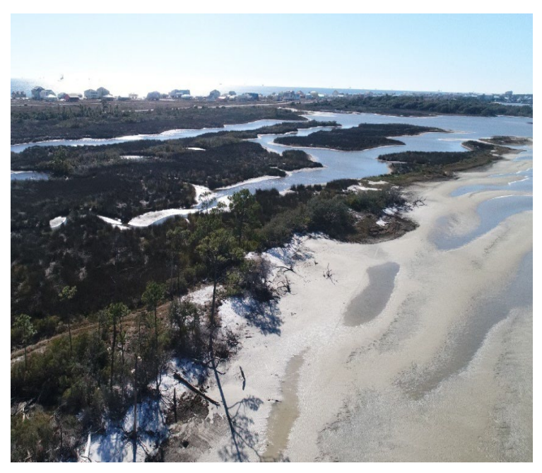
The former Pilot Town property on Fort Morgan Peninsula was acquired and preserved in perpetuity.

Approximately 73.43 acres acquired on Fort Morgan Peninsula in Alabama were incorporated into Bon Secour National Wildlife Refuge in July 2023. This land acquisition was part of the Regionwide Trustee Implementation Group's September 2021 Restoration Plan 1. This successful acquisition was the result of DWH NRDA settlement funds and collaborative efforts between