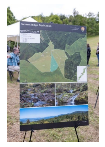
Tanners Ridge Dedication in May 2023.

The official Tanners Ridge Dedication Ceremony was held on May 18, 2023, and was hosted by the Shenandoah National Park (SNP) and the SNPT. The event celebrated the SNPT's donation of 969 acres to the Park to be protected in perpetuity. The acquired parcels (from 3 different landowners) contain relatively undisturbed forested habitat for migratory birds, bats, and other wildlife, as well as headwaters streams that support brook trout. Because the parcels are adjacent to SNP, this acquisition and donation increases the amount of contiguous protected habitat for migratory birds, bats (including Indiana Bat and Northern Long-Eared Bat), and other wildlife. To date, this is the largest (acreage) acquisition funded by the DuPont NRDAR settlement.