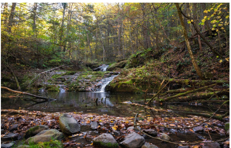
Photo of land on Tanners Ridge acquired by the Shenandoah National Park Trust. Of note, there were several large, healthy hemlocks near the creek (Naked Creek), and a waterfall.

In 2023, the Shenandoah National Park Trust (SNPT) acquired 969 acres of rolling woodlands in Page County, VA that had been under threat of development for many years. The acquisition of these acres by the SNPT was made possible through DuPont Waynesboro Natural Resource Damage Assessment and Restoration (NRDAR) settlement funds and the collaboration of many partners and landowners including the SNPT, Potomac Appalachian Trail Club, Valley