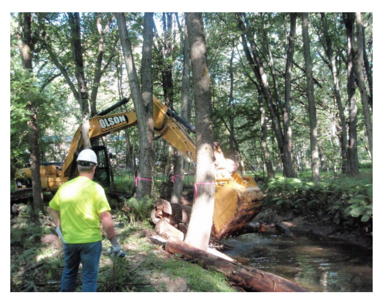
Installation of woody habitat in Lancaster Brook. Pictured - Staff from Oneida Nation overseeing the project.

The Fox River/Green Bay Trustees helped support the acquisition and protection of a 17-acre parcel within the Oneida Reservation. Protecting this parcel is significant as it contains a 1,950 foot reach of Lancaster Brook, a Class II brook trout stream, along with approximately 7 acres of adjacent wetland habitat. Protection of this important area also facilitates the ability to enhance habitat to a preferred state through restoration projects. As a result, fish passage impediments have been addressed and woody habitat has been added to the stream - adding log structures to this reach of stream creates feeding habitat and refugia for brook trout.