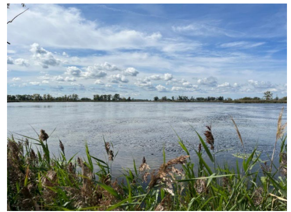
Pearson property which is owned by the Ohio Department of Natural Resources.

The Trustees for Ottawa River include the U.S. Department of the Interior, acting through the U.S. Fish and Wildlife Service (FWS) and the State of Ohio, acting through the Ohio EPA. Recently, 286.5 acres of coastal marsh and upland habitat were protected through property acquisitions that were primarily funded with the Ottawa River NRDAR case settlement. The FWS provided a grant to Ducks Unlimited for the purchase of four properties that will be protected in perpetuity, three of which the Ohio Department of Natural Resources, Division of Wildlife will take ownership.