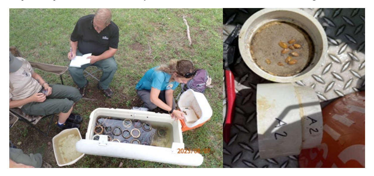
(right) Field biologists investigating juvenile mussel growth and weight in the Kanawha River, WV. (left) Field biologists getting initial weights on juvenile mussels before being deployed.

Damage assessment cases are conducted by one or more of the resource management bureaus within the Department: Fish and Wildlife Service, National Park Service, Bureau of Land Management, Bureau of Indian Affairs, and Bureau of Reclamation. Support for economic analysis is provided by the Office of Policy Analysis; scientific and technical analysis and support is provided by the U.S. Geological Survey; and the Office of the Solicitor provides legal counsel. In nearly all cases, the Department's assessment activities are carried out in partnership with other Federal, State, and/or Tribal co-trustees. These partnerships have proven advantageous, as cooperation, consultation, and collaboration amongst the trustees facilitates addressing multiple resource management concerns across different levels of governments and consolidates those concerns into a single case. Trustees can also share data, achieve economies of scale, avoid duplication of effort and minimize administrative burdens and expenses. Responsible parties also benefit, as they are able to address all trustee concerns in a single, unified case.