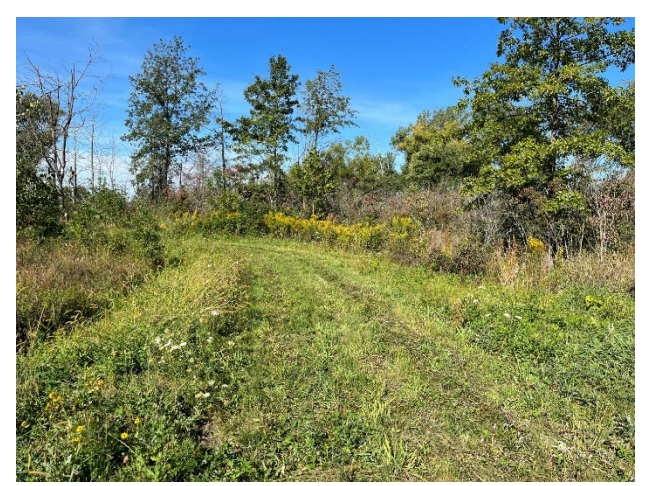
Hageman Unit that is now owned and maintained by Ottawa National Wildlife Refuge.

The hazardous substances migrated from landfills along the banks of the Ottawa River and industrial facilities in the watershed, contaminating water, fish, and wildlife in the Ottawa River. These landfills have been remediated under CERCLA, RCRA and CWA authorities by the US Environmental Protection Agency (EPA) and Ohio Environmental Protection Agency (Ohio EPA).