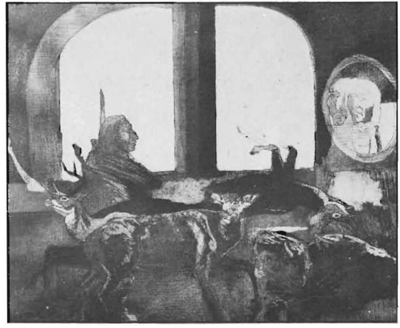
8. UNTITLED. 1973. Oil on canvas, 21 1/2"x24".