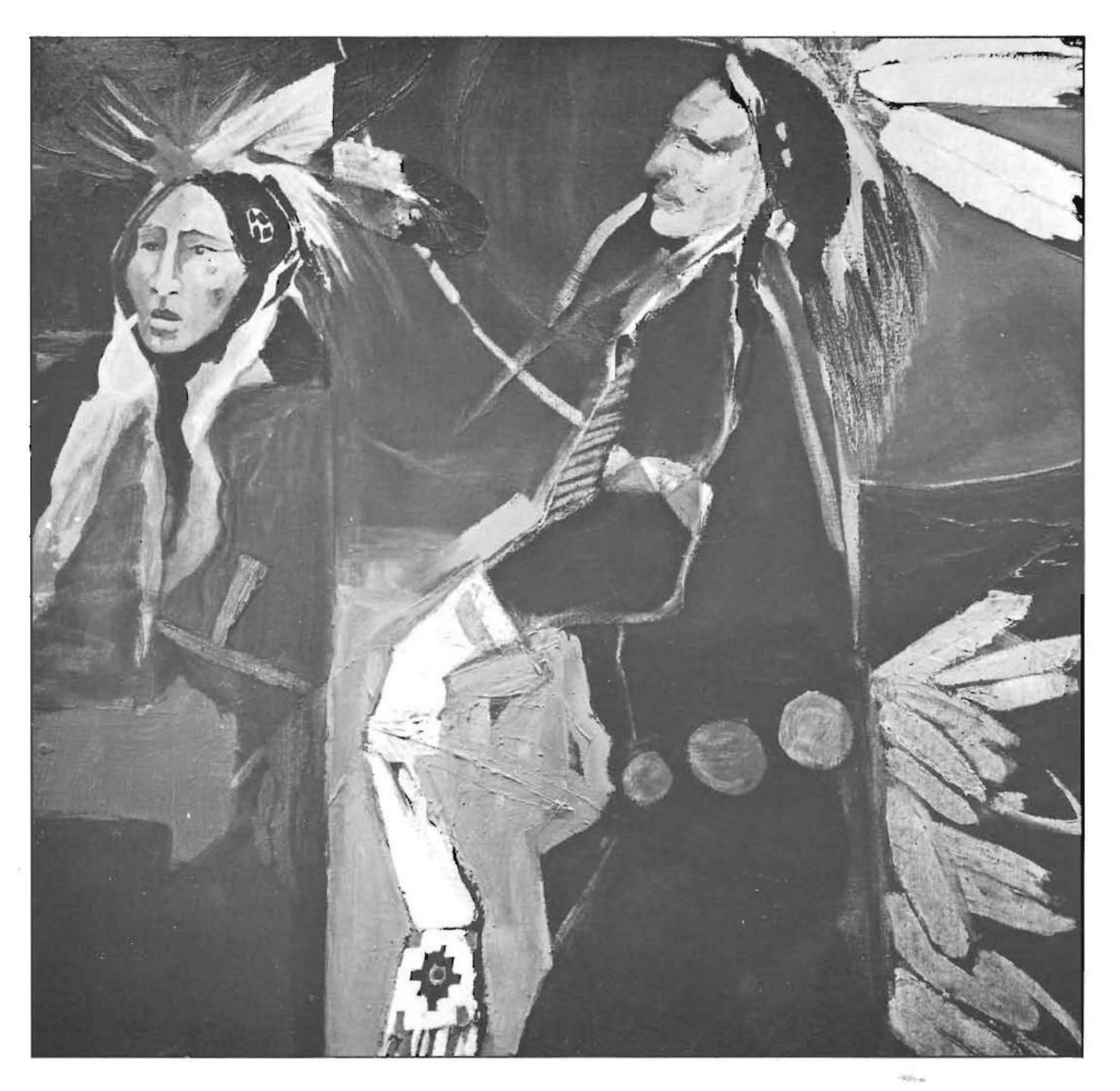
Paintings By Penn