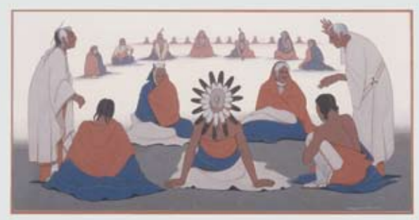
Oscar Howe, Yanktonai Sioux, Sioux Council, 1950