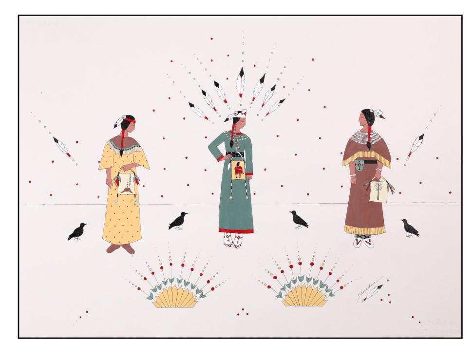
Pow Wow Girls/ Tribute to Margaret Kilgallen Ink and gouche on Arches paper © 2022 Sheridan MacKnight