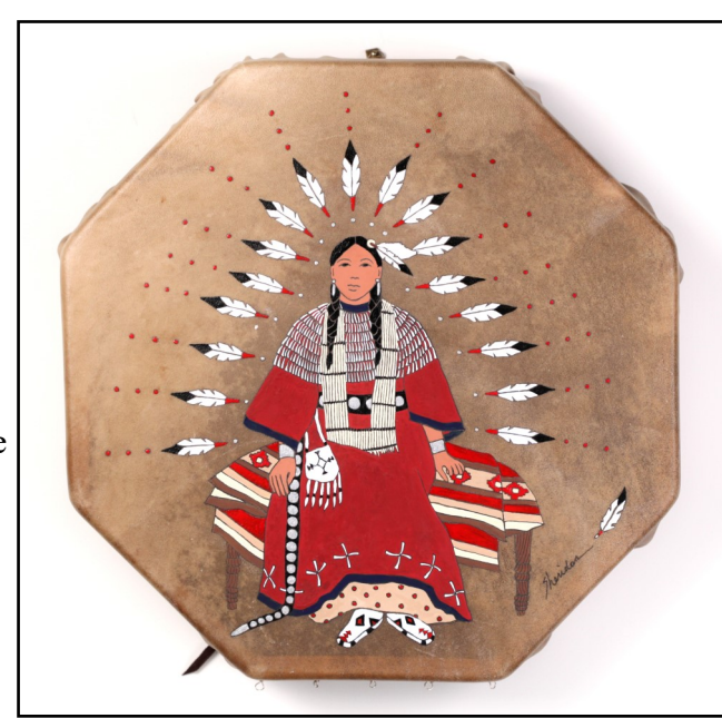
Pytanyetu/Autumn Ink and gouche on Arches paper © 2022 Sheridan MacKnight