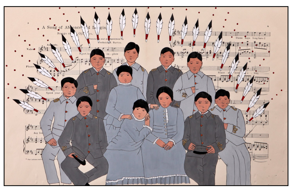
A Song of Absence & Longing Colored pencils and ink on antique sheet music © 2018 Sheridan MacKnight