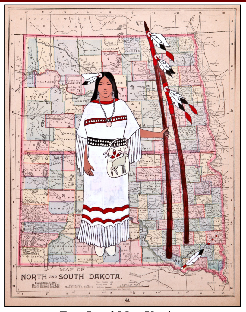
Eva, Land Map Version Ink and gouche on antique map © 2022 Sheridan MacKnight

Strong Heart Woman featuring Sheridan MacKnight