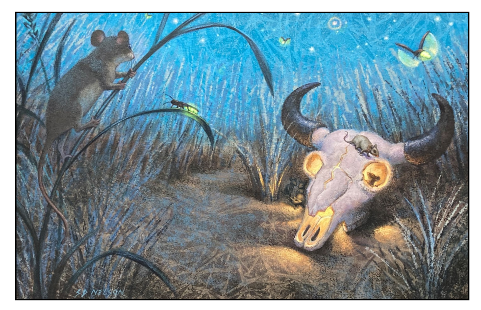
Dance in a Buffalo Skull (from the book Dance in a Buffalo Skull) Acrylic on board © 2007 S.D. Nelson