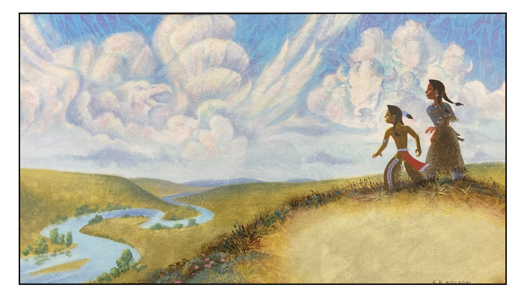
Cloud People I (from the book The Star People ) Acrylic on paper © 2003 S.D. Nelson