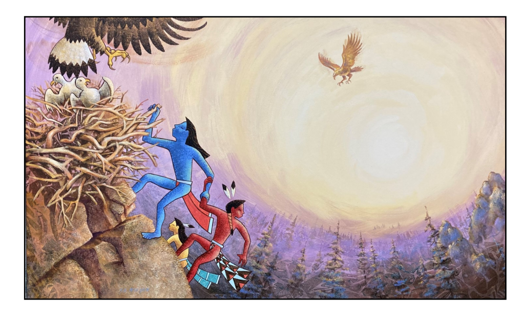
Crazy Horse's Vision (from the book Crazy Horse's Vision ) Acrylic on board © 2000 S.D. Nelson