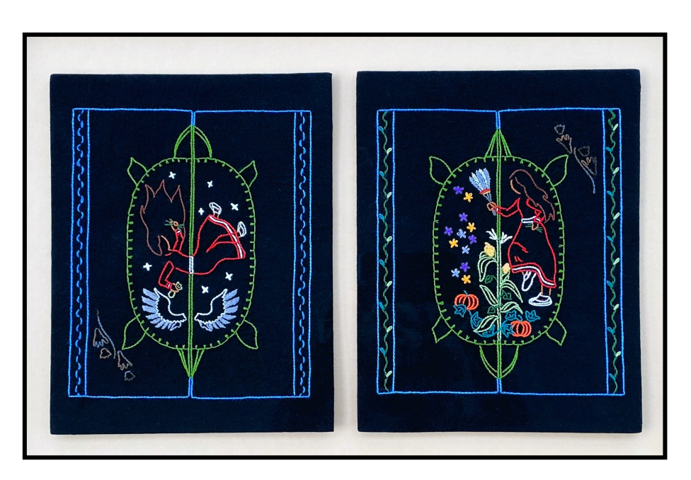
Sky Woman, Turtle Island, and the Three Sisters Embroidery © 2020 Loriene Pearson