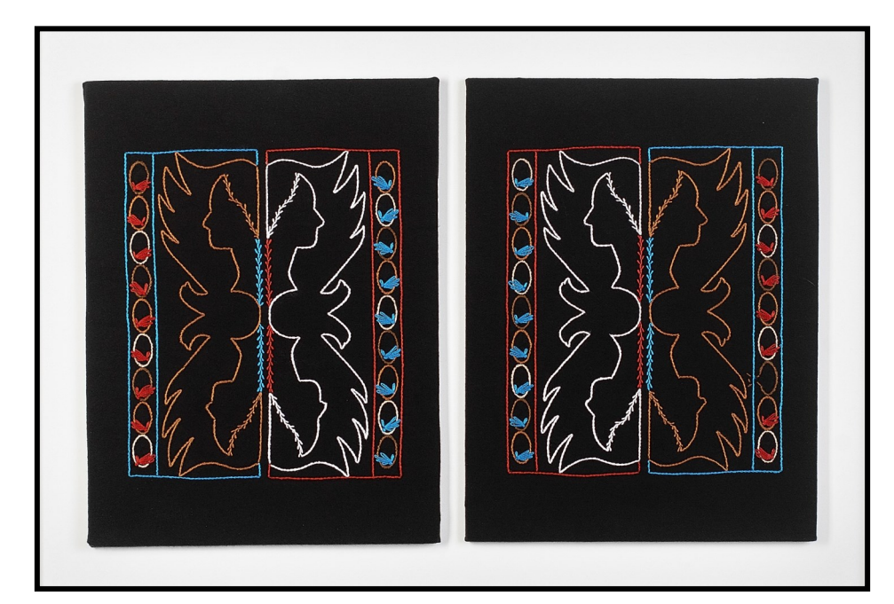
MMIW: Break the Chain Embroidery © 2020 Loriene Pearson