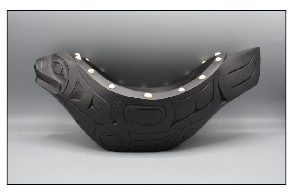
Tsaa X'ayeit (Seal Bowl) Red cedar, operculum, acrylic