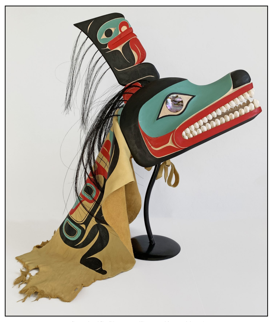
Gunakadéit S'aaxwu (Sea Wolf Headdress) Red cedar, abalone, operculum, horse hair, deer hide © 2020 James Johnson